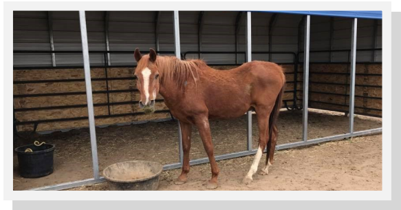
Photos are of Amir and Rapture enjoying two of the buildings we were able to install thanks to GIVE! 2016