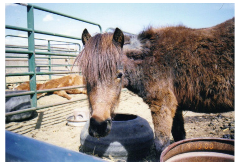
Cupcake - April 13, 2000