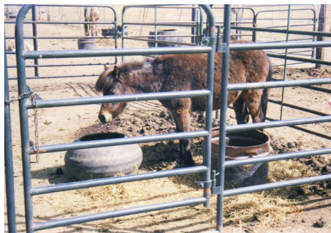
Cupcake - April 13, 2000