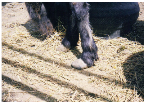
Cupcake's feet - April 13, 2000

Saving Cupcake was my first experience in life that not all "horse rescues" are actually what they claim to be. While visiting the Horse Expo in Denver in March of 2000 I visited a rescue booth and saw a picture of a little brown mare advertised as a Miniature Horse for adoption at a "rescue" in Wellington, Colorado. Some weeks later I visited the "rescue" to look at Cupcake and found the conditions there what I would consider to be less than adequate. The horses were all in 12 x 12 or 12 x 24 pens made from portable panels with no shelter . Hoof care, veterinary care, and worming seemed to be non-existent based on the condition of the horses I saw there. Cupcake turned out to be a pony, not a Miniature Horse. I could not leave her there and went back for her a couple of weeks after my initial visit. Cupcake was so fearful of people she had to be sedated for her initial hoof trimming and still has trust issues to this day. She is healthy and happy living in a herd of Miniature Horses which have become her family. I was told in 2000 that Cupcake was 2 years old, and that as a foal was at a slaughter plant with her mother. Cupcake was turned away for being too small and the truck driver delivering the horses dropped her at the rescue in Wellington. Cupcake is still distrustful of people even after 9 years in our home, but can now be haltered and led, groomed, wormed, vaccinated, and have her front hooves trimmed without sedation.